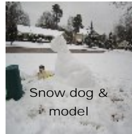
Snow dog & model

2-19 Knowledge Bowl , Channel 3-TV 9:-9:30 a.m. Germantown versus Houston. A neighborhood youngster is participating.