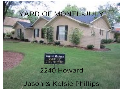
A great example of turning "older landscaping" into a modern look. Congratulations!